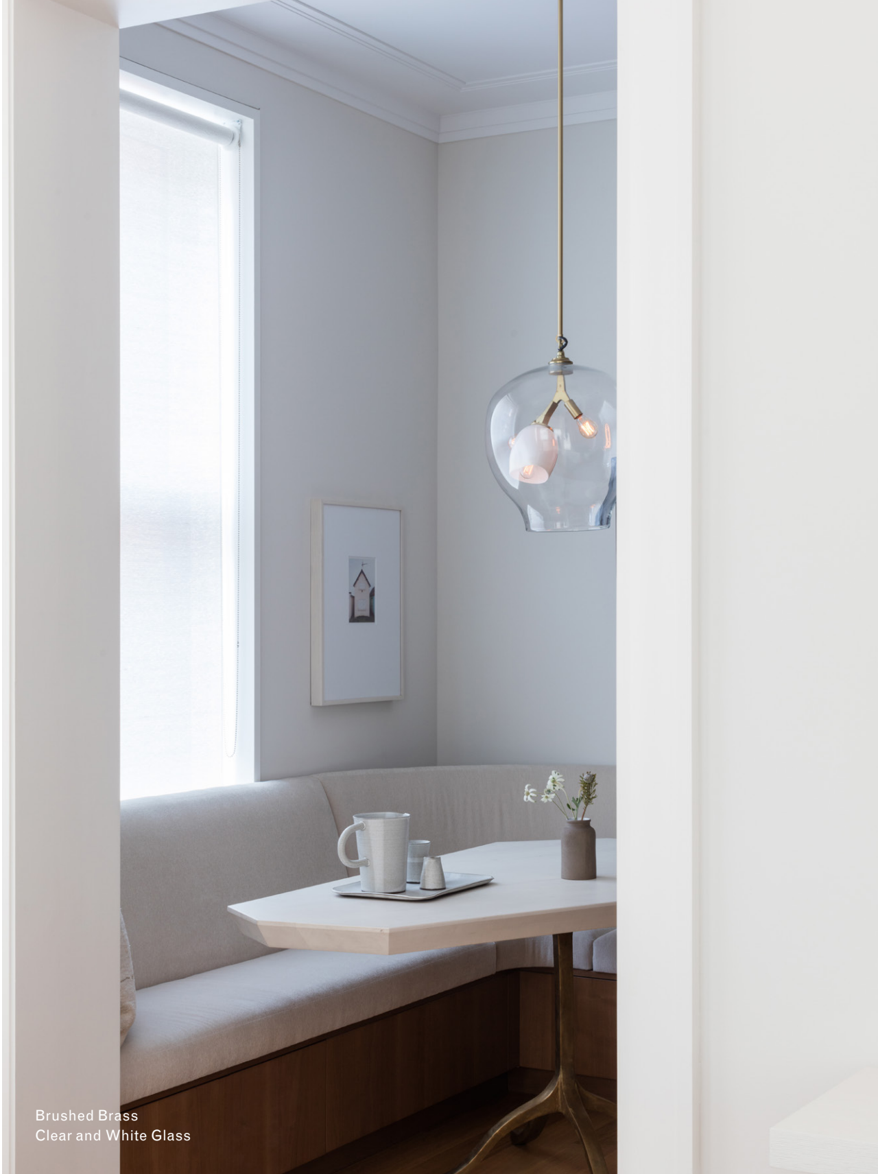
Brushed Brass Clear and White Glass