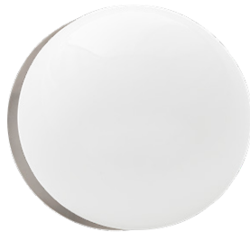
Satin Nickel & White Glass