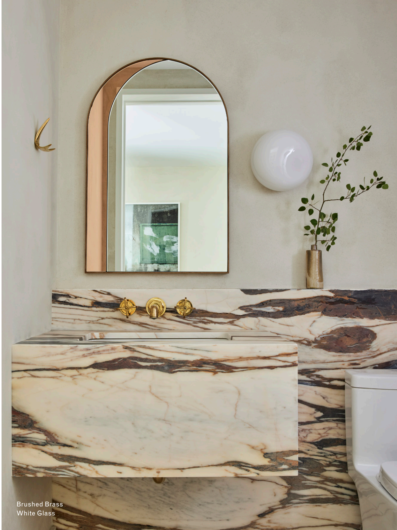
Brushed Brass White Glass