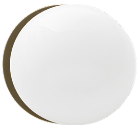
Vintage Brass & White Glass