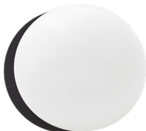
Oil Rubbed Bronze & White Glass