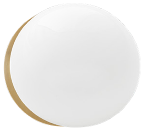
Brushed Brass & White Glass