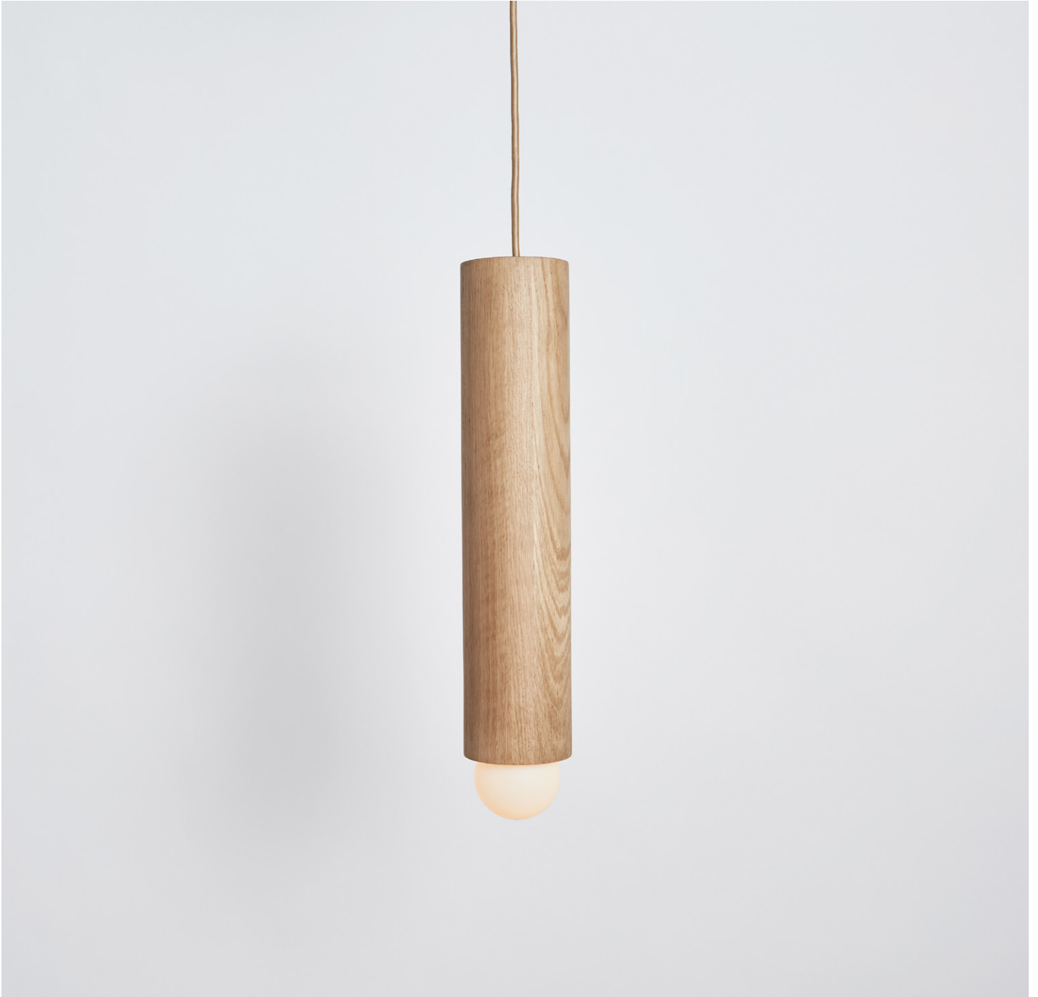
TOWER PENDANT I natural oak