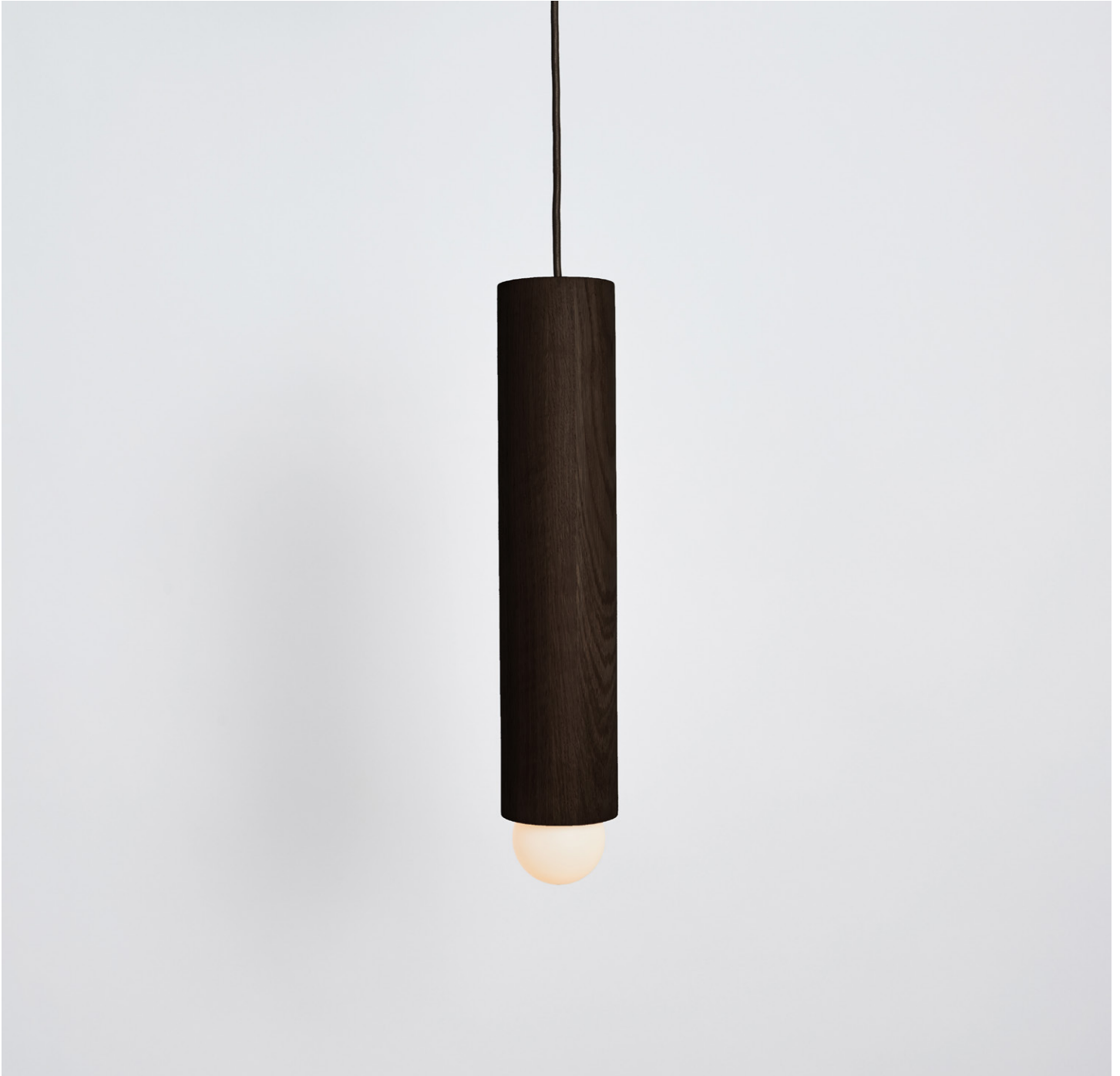
TOWER PENDANT I oxidized ash