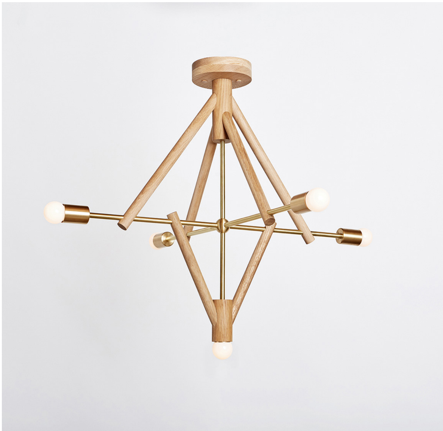
LODGE CHANDELIER V natural oak