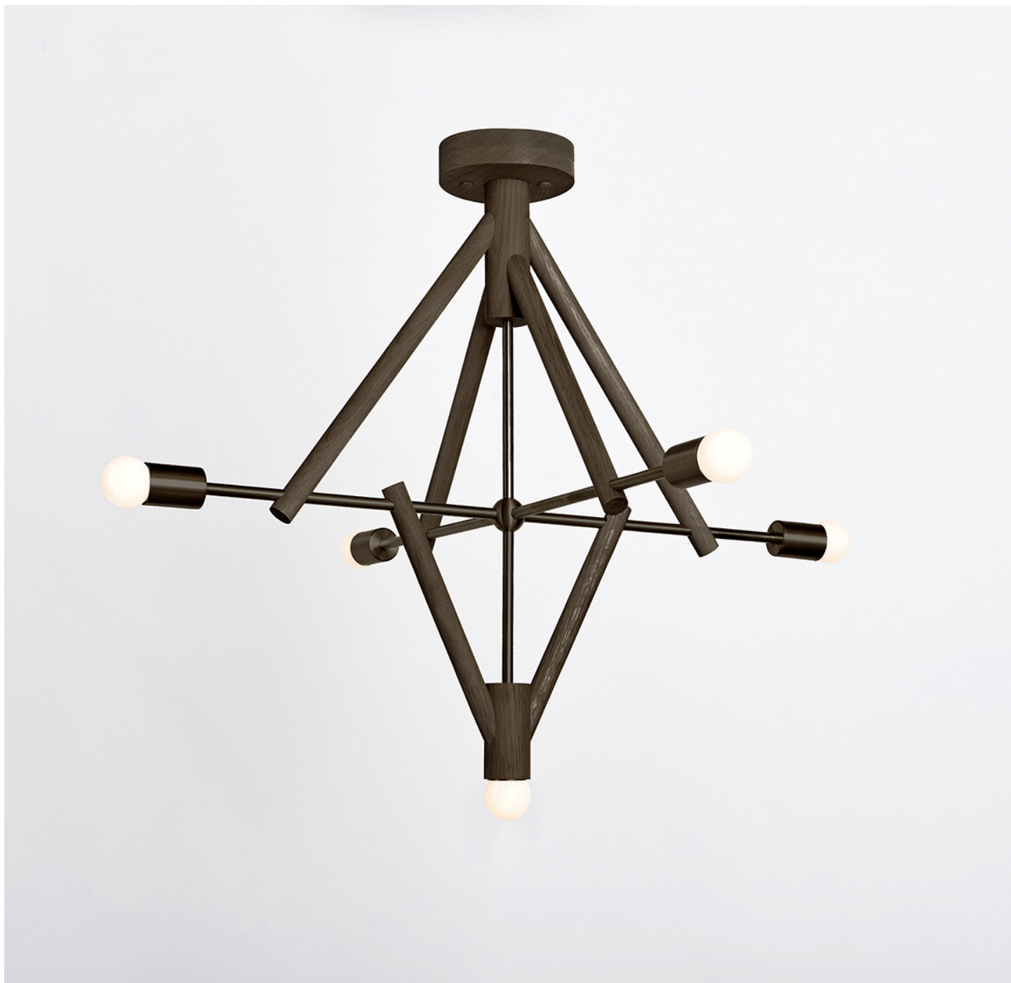
LODGE CHANDELIER V oxidized ash