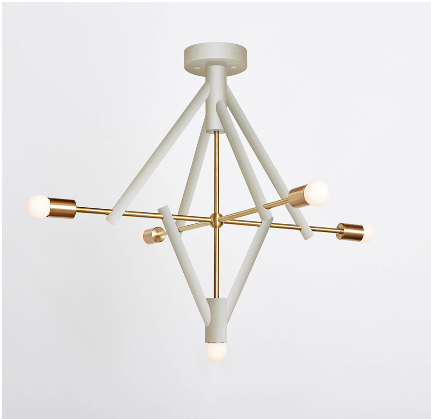
LODGE CHANDELIER V painted white