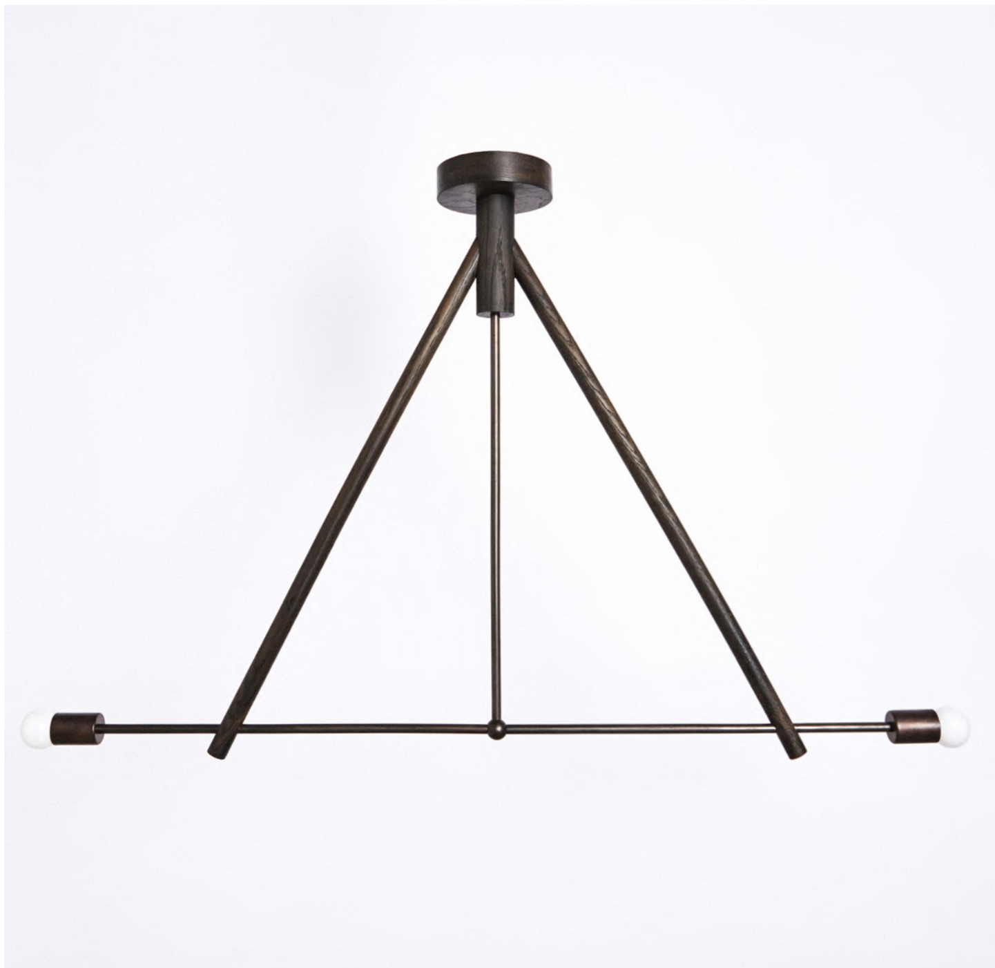
LODGE CHANDELIER II oxidized ash