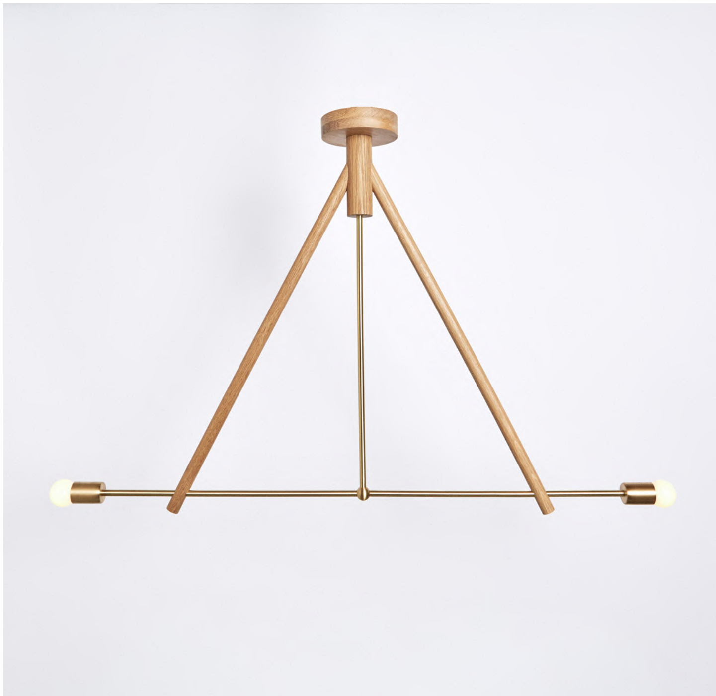
LODGE CHANDELIER II natural oak