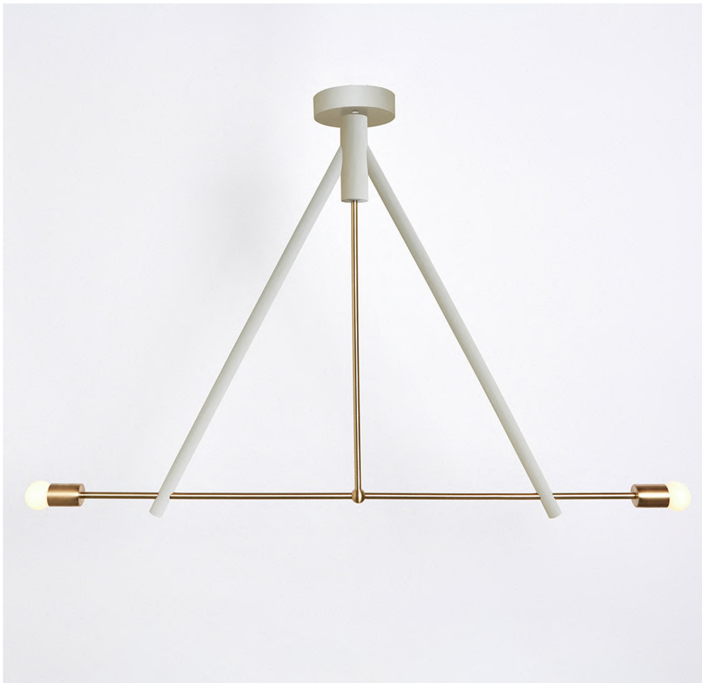
LODGE CHANDELIER II painted white