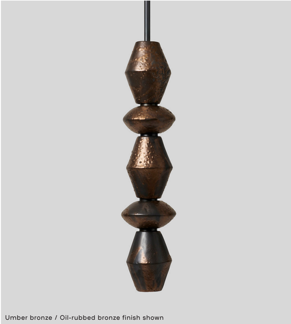
Umber bronze / Oil-rubbed bronze finish shown