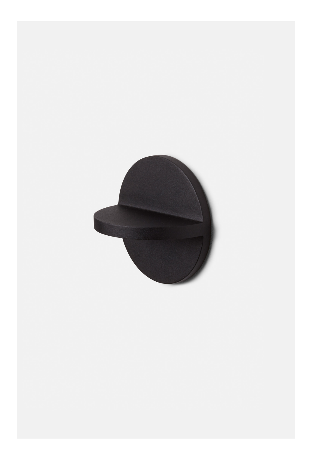
For 2D & 3D drawings of all products, including CAD, Revit and IES files, please visit rbw.com

50 Greene St New York NY 10013 T +1 212 388 1621 sales@rbw.com