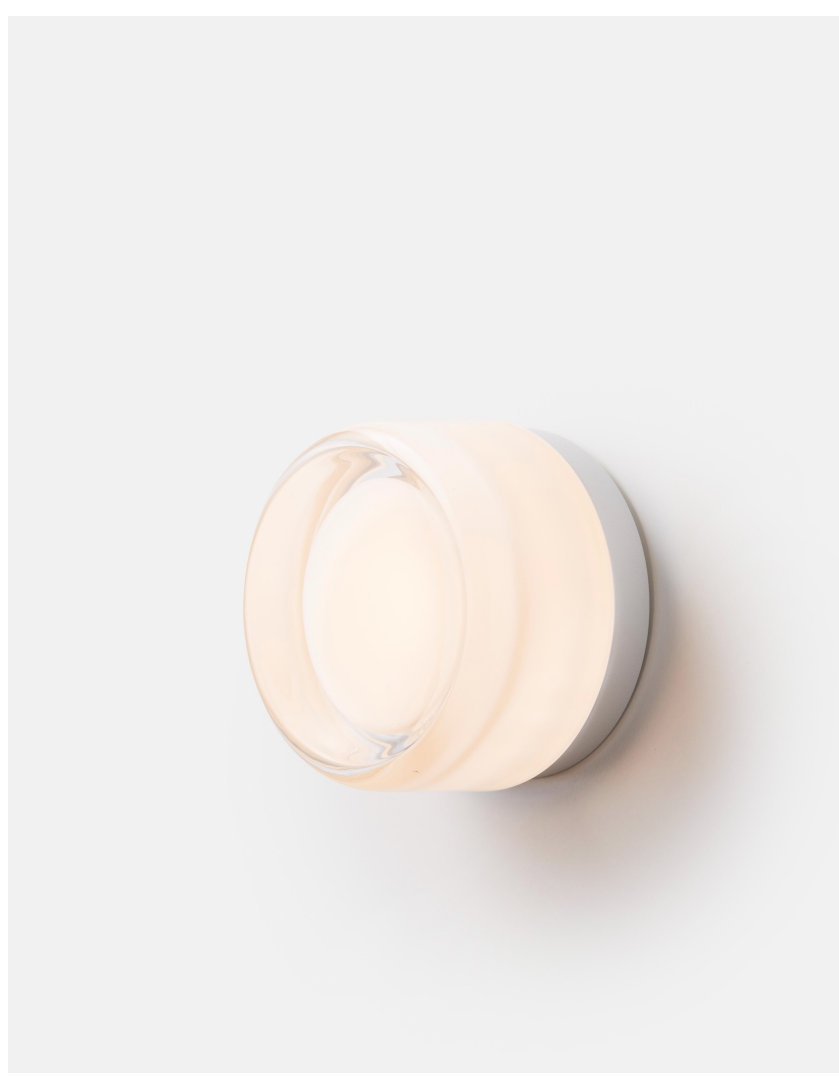
For 2D & 3D drawings of all products, including CAD, Revit and IES files, please visit rbw.com

50 Greene St New York NY 10013 T +1 212 388 1621 sales@rbw.com