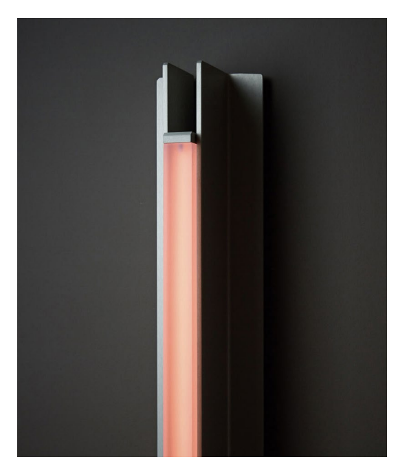
Pictured in Anodized Silver with Rose Lens