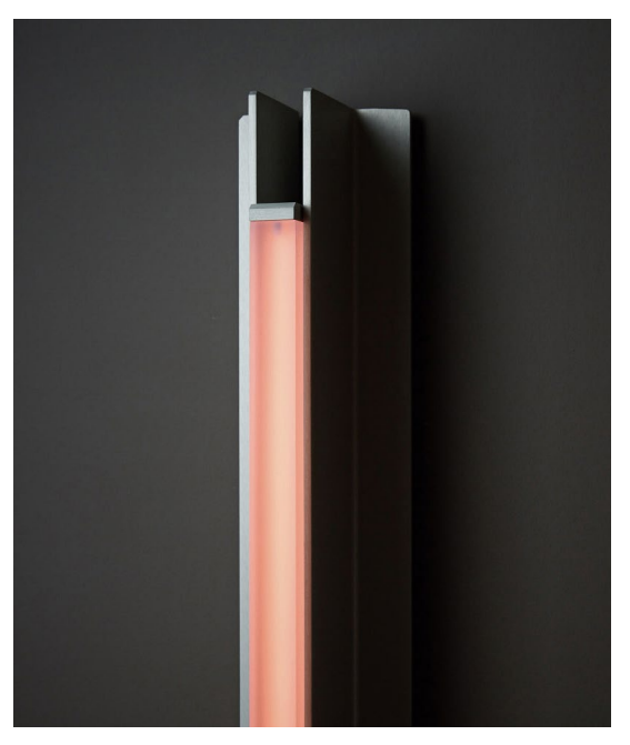
Pictured in Anodized Silver with Rose Lens