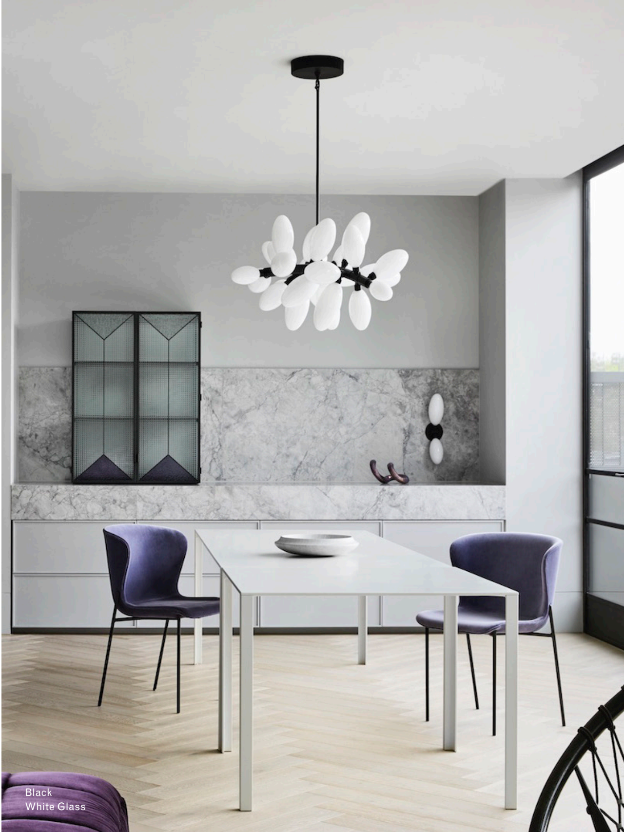
Black White Glass