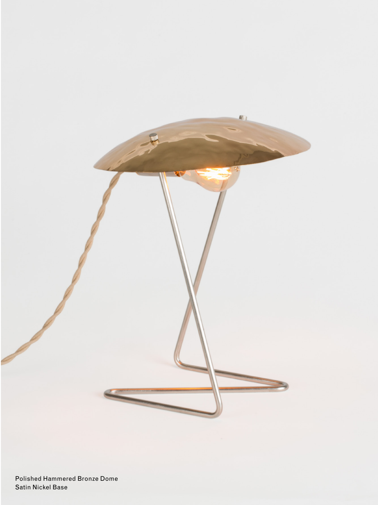
Polished Hammered Bronze Dome Satin Nickel Base