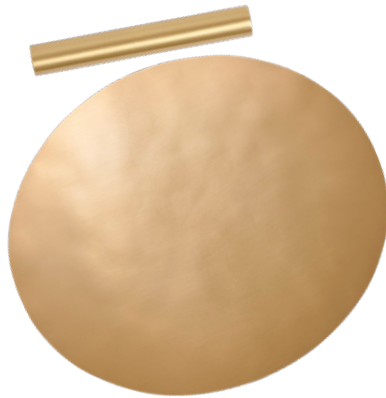
Brushed Hammered Bronze Dome & Brushed Brass Base