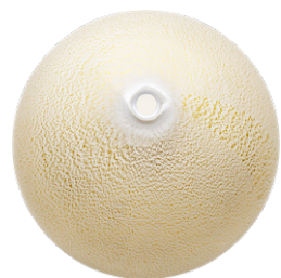
White Glass with 24k Gold Foil