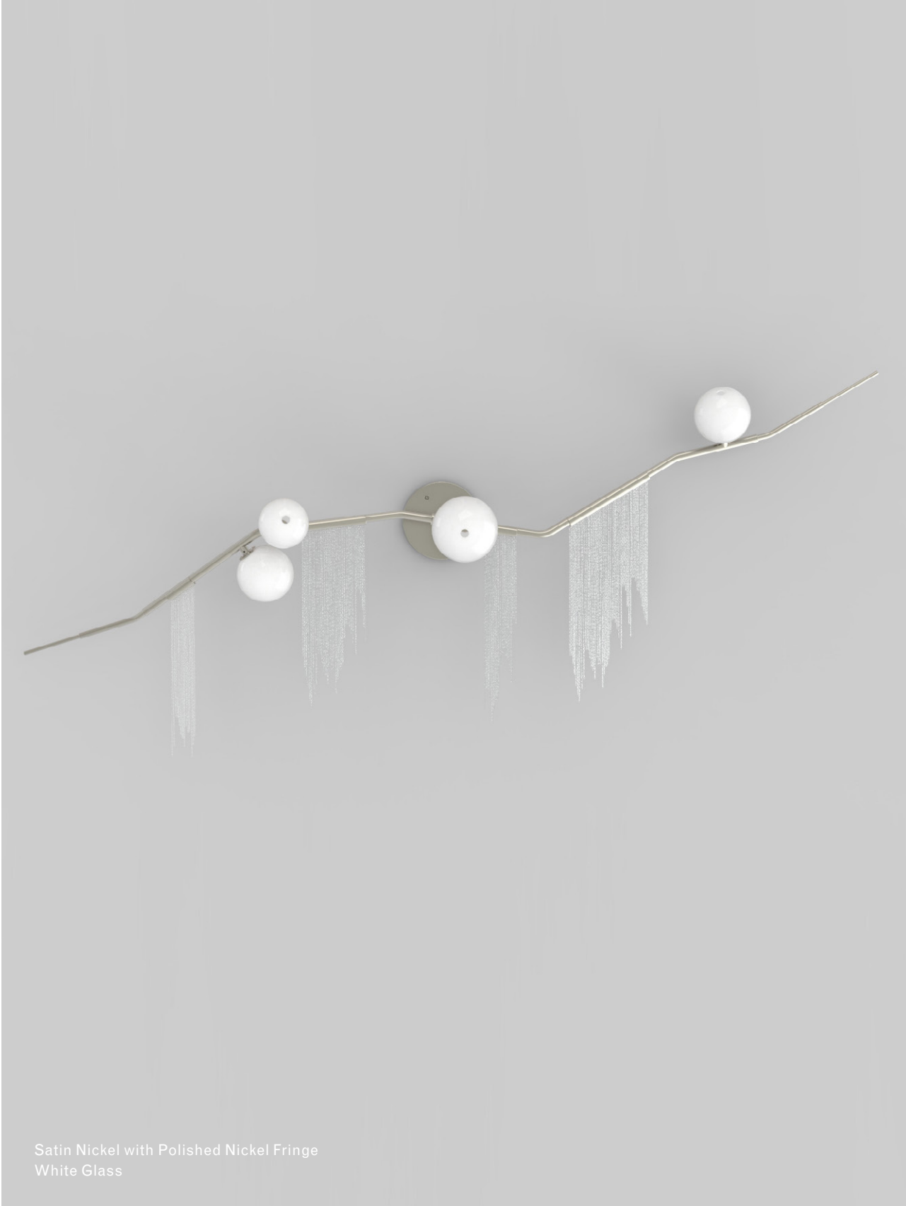
Satin Nickel with Polished Nickel Fringe White Glass