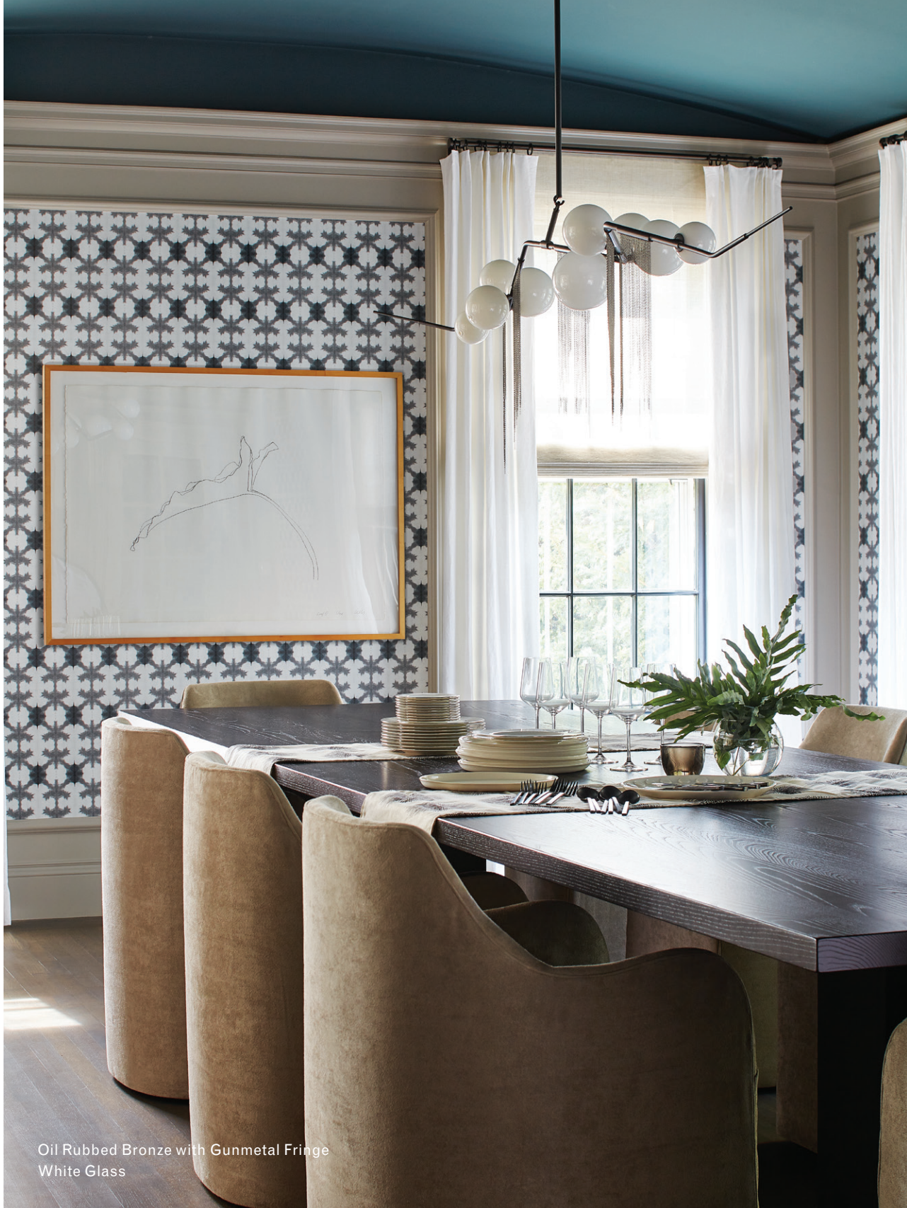
Oil Rubbed Bronze with Gunmetal Fringe White Glass