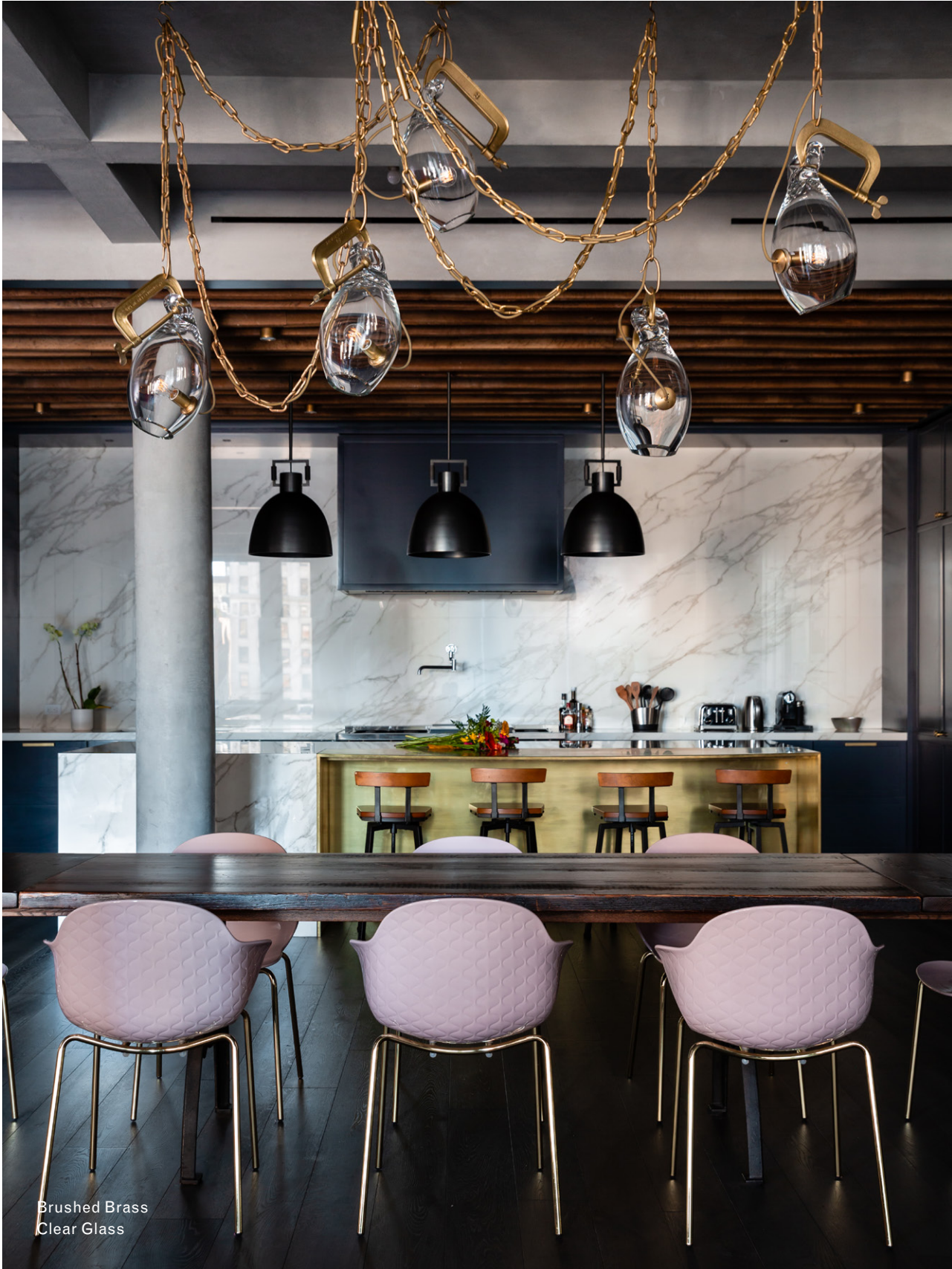
Brushed Brass Clear Glass