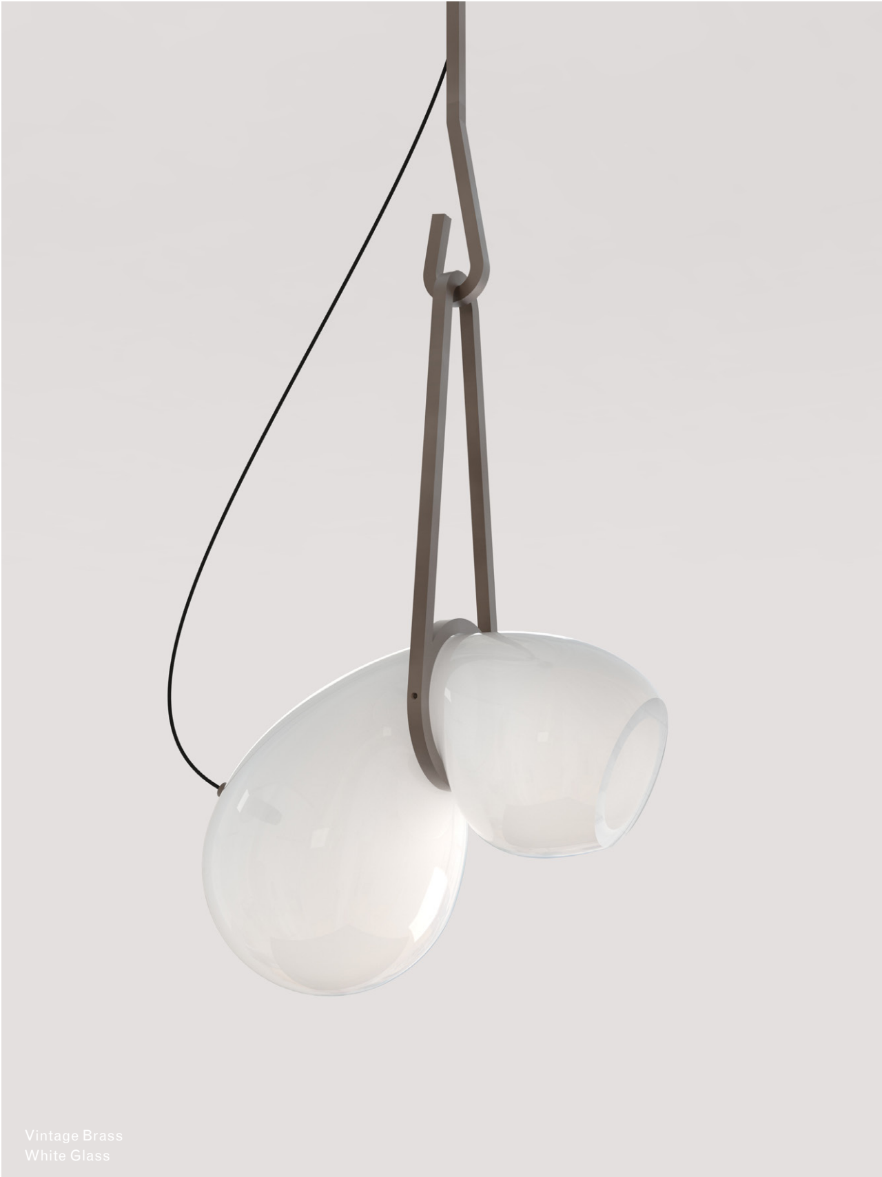
Vintage Brass White Glass