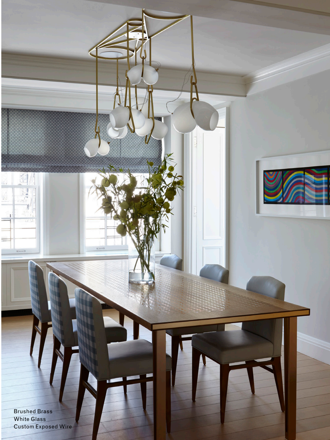
Brushed Brass White Glass Custom Exposed Wire