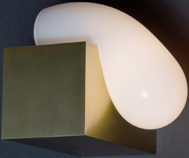
Brushed Brass White Glass