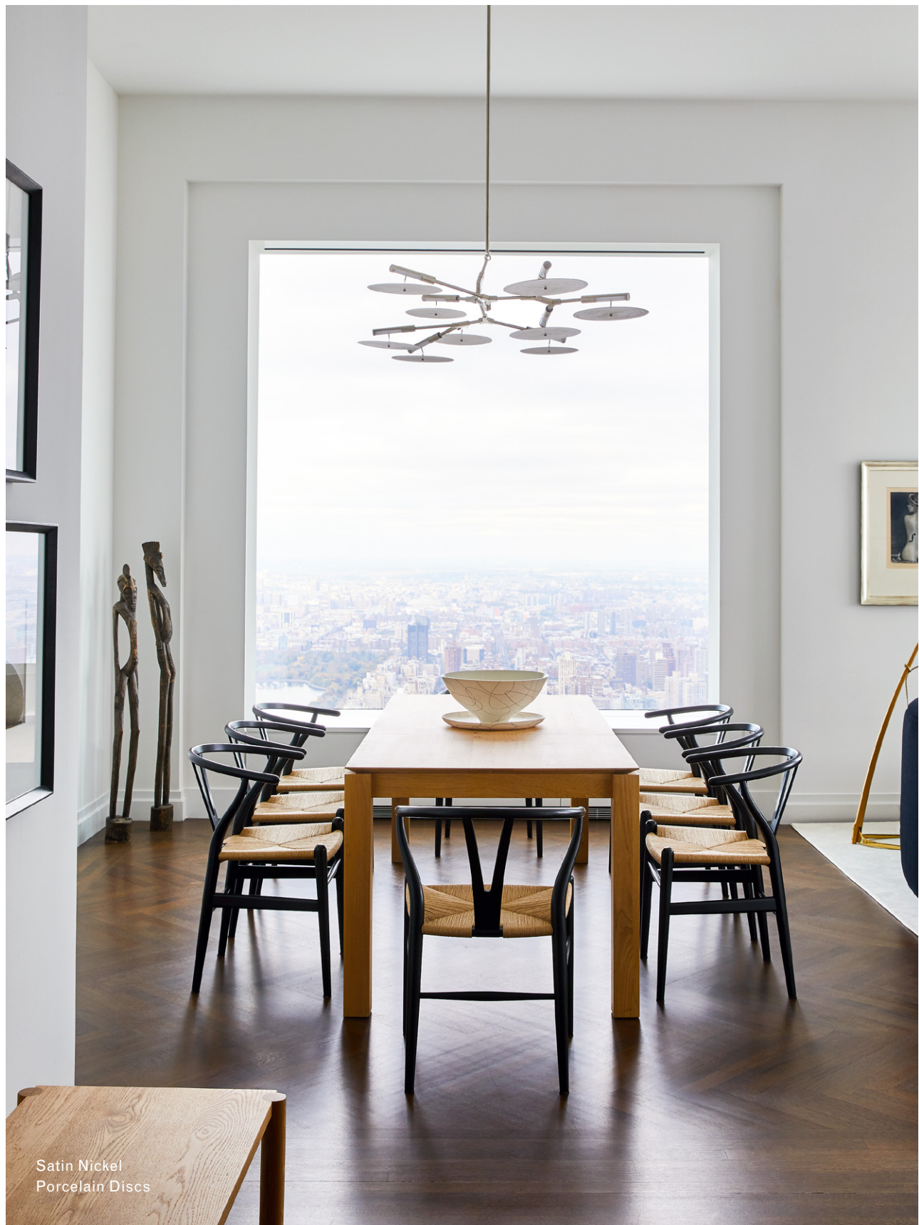
Satin Nickel Porcelain Discs