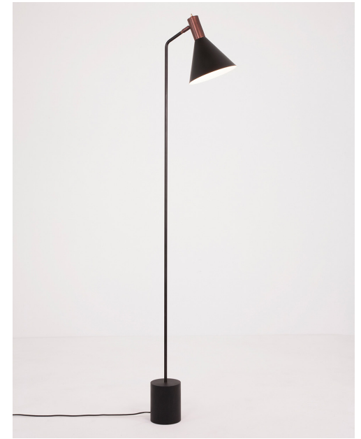
Handmade in Los Angeles