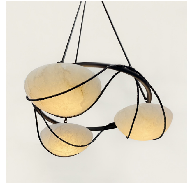
Handmade in Los Angeles