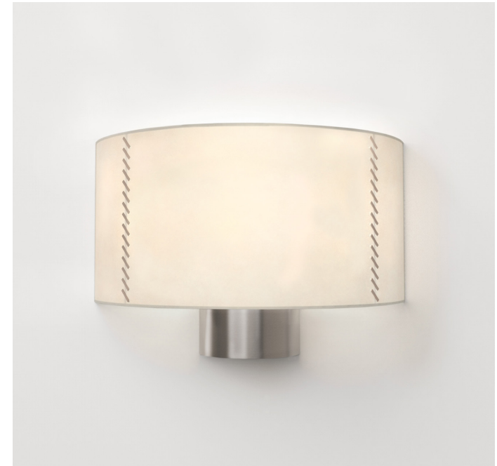
Handmade in Los Angeles

Finishes ● Satin Brass ● Polished Brass ● Silver Patina Shade ● Parchment Paper ● Parchment Hide