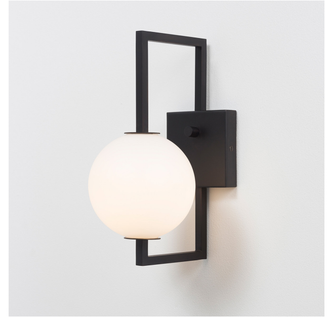
Handmade in Los Angeles