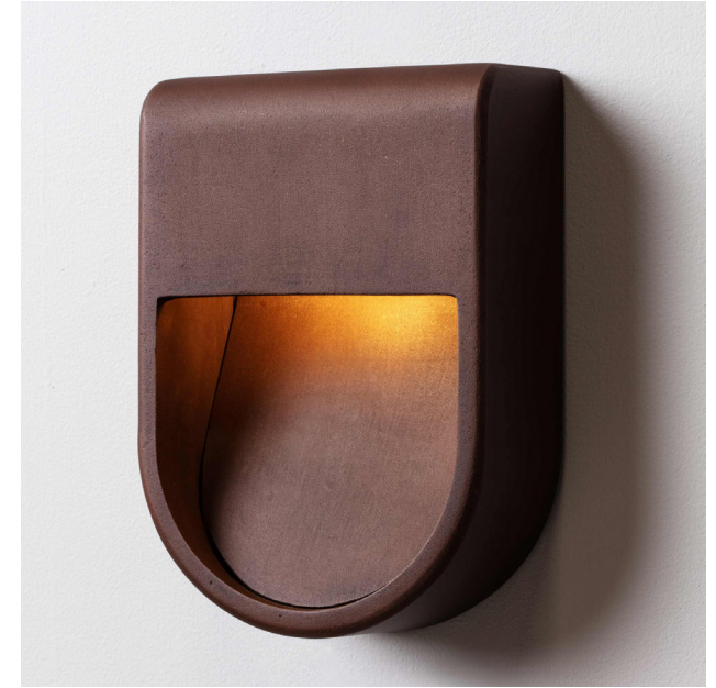
Handmade in Los Angeles