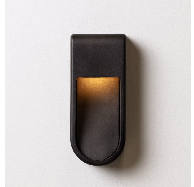
Handmade in Los Angeles