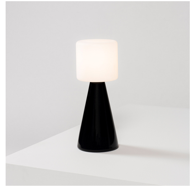
Handmade in Los Angeles