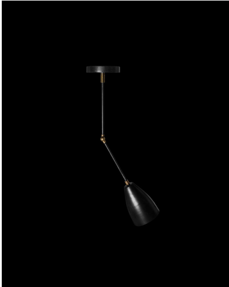
BLACKENED BRASS / AGED BRASS