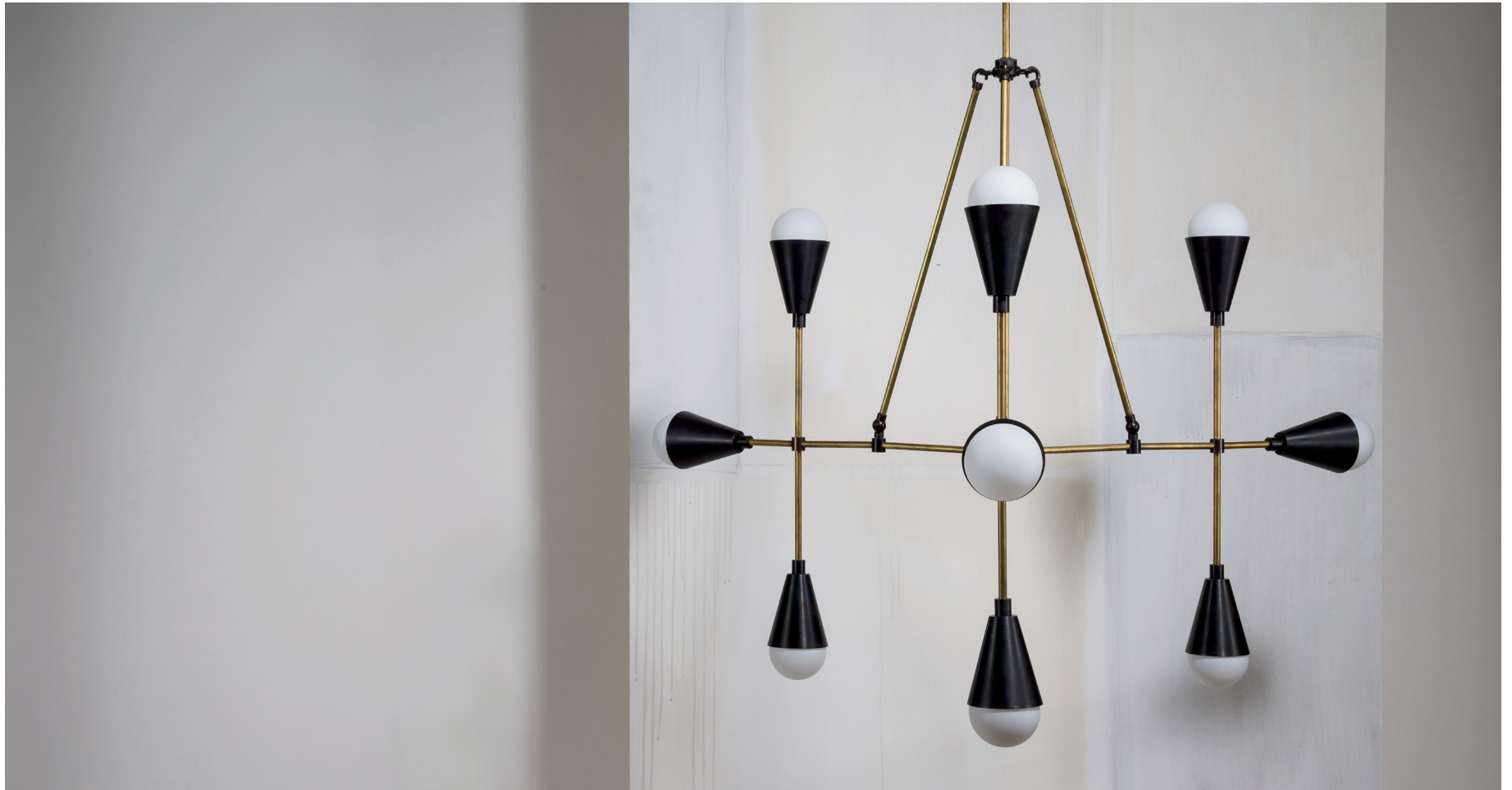
AGED BRASS / BLACKENED BRASS