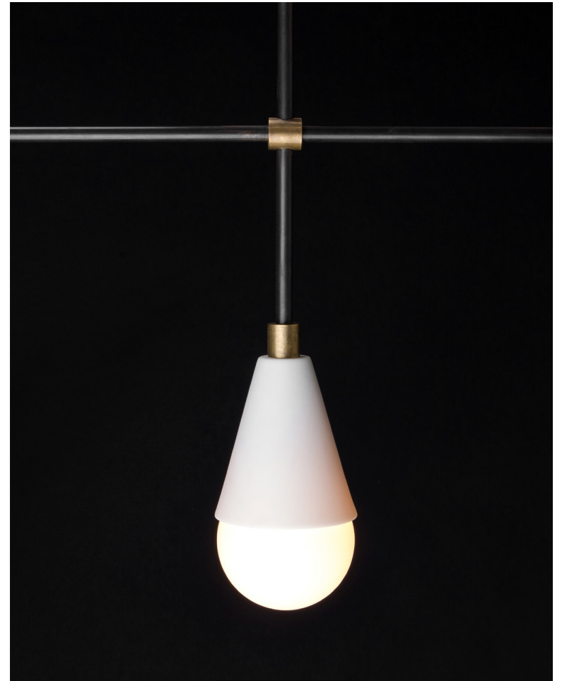
AGED BRASS / BLACKENED BRASS / PORCELAIN