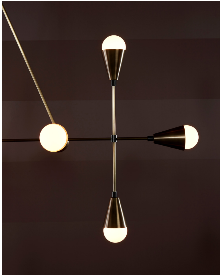
AGED BRASS / BLACKENED BRASS