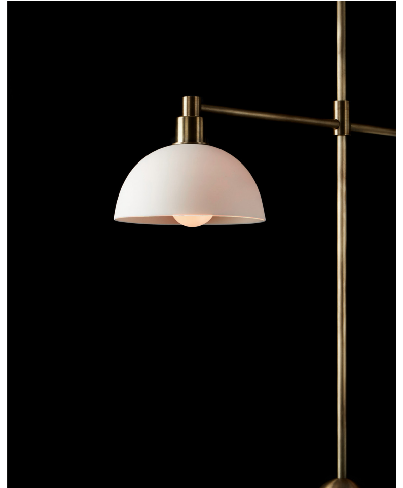
AGED BRASS / PORCELAIN