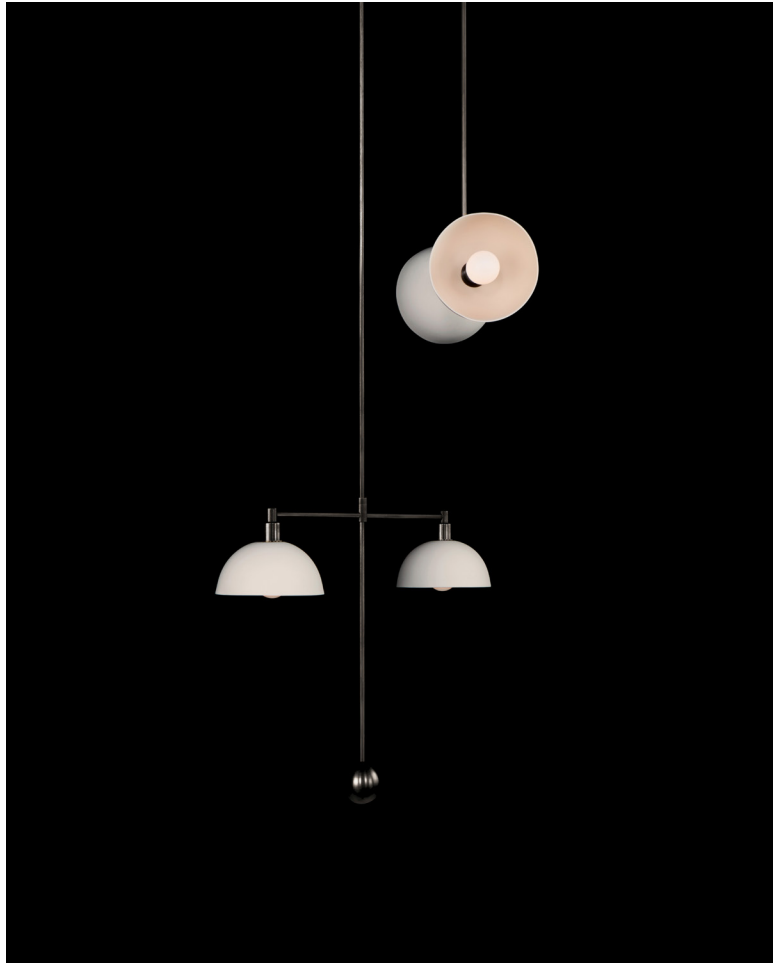
BLACKENED BRASS / PORCELAIN