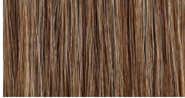
HORSEHAIR - FLAXEN