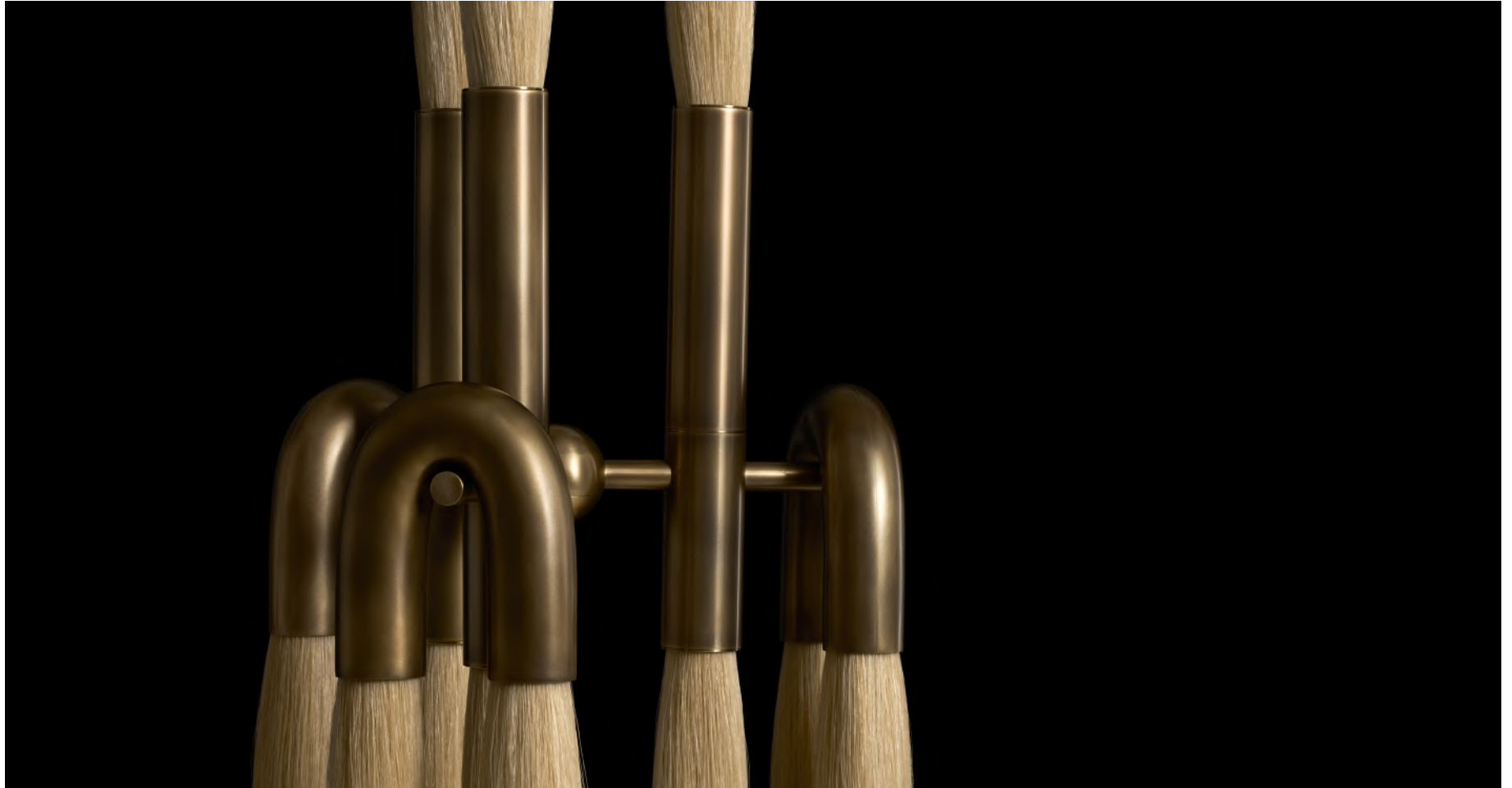
AGED BRASS / PALOMINO HORSEHAIR