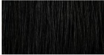
HORSEHAIR - JET BLACK