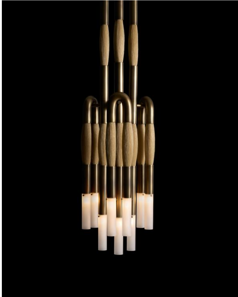
AGED BRASS / PALOMINO HORSEHAIR