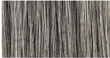
HORSEHAIR - SILVER