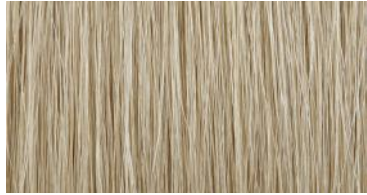
HORSEHAIR - PALOMINO