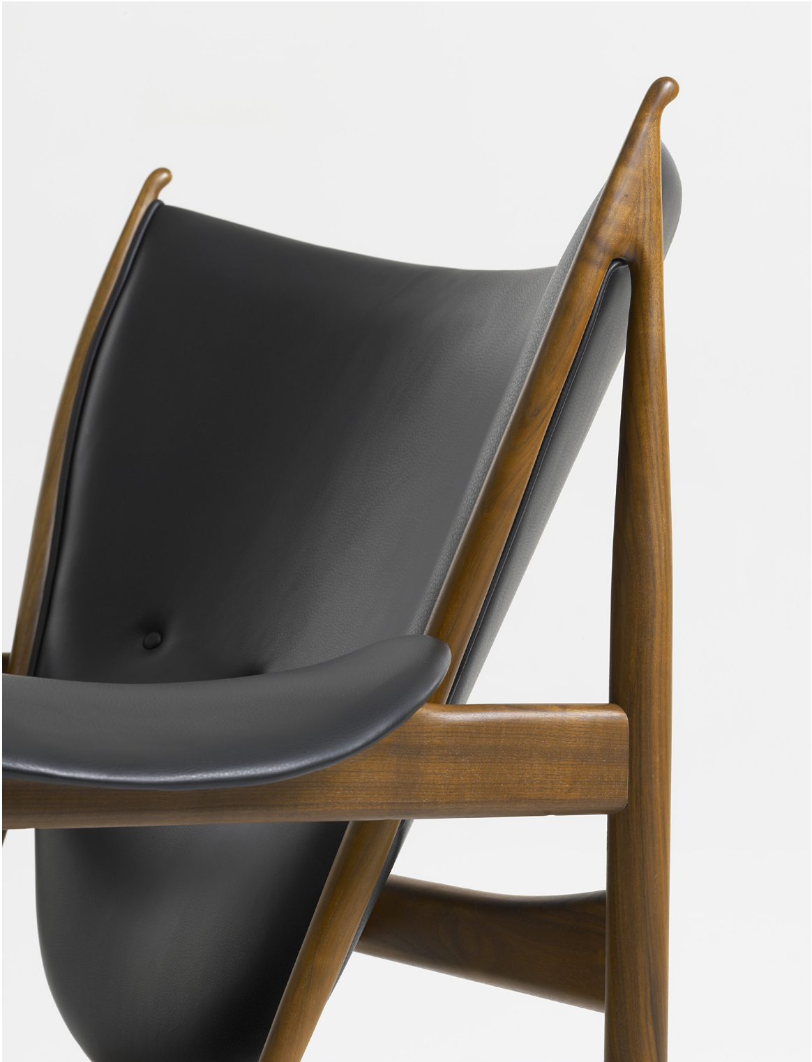
CHIEFTAIN CHAIR 1949 BY FINN JUHL ———