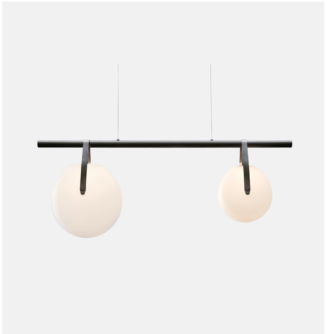
Shown: GC-4210 (2 Sym. mixed Globes)

37 W 20th Street Suite 707 New York NY 10011 T +1 212 388 1621 sales@richbrilliantwilling.com